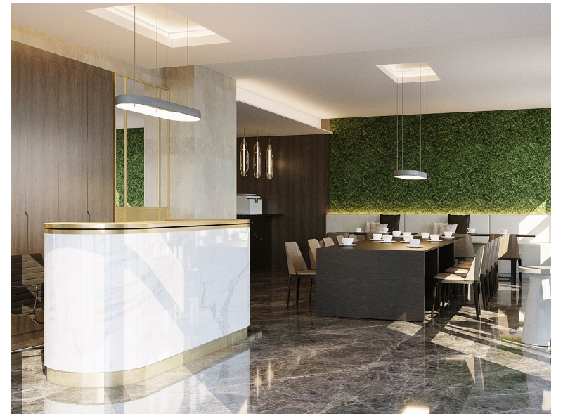
Senayan Campus Lobby Area