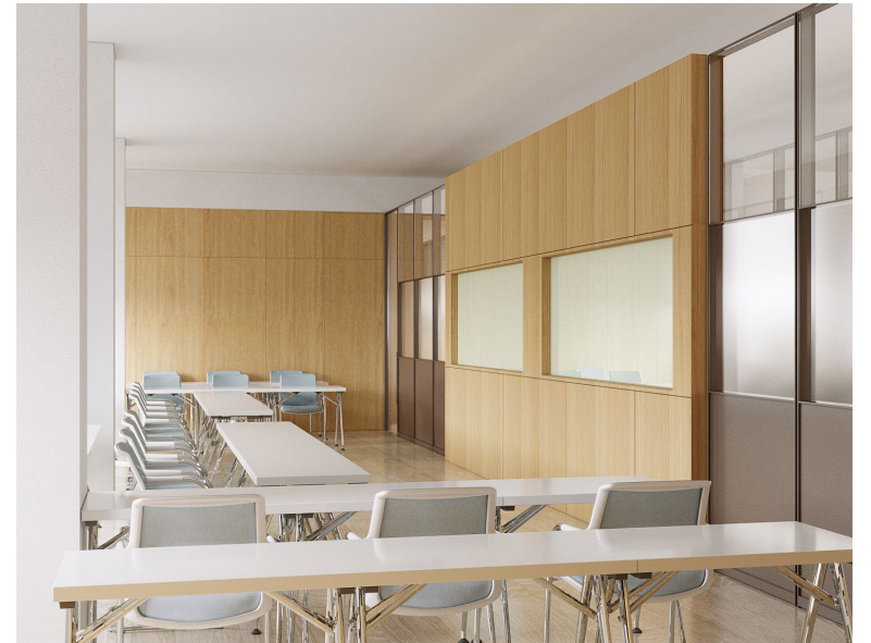
Senayan Campus Classroom