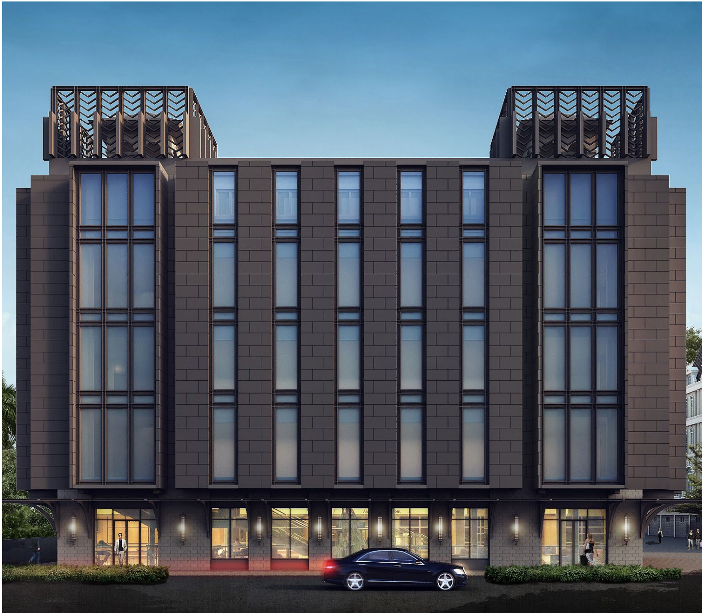
BII Jakarta Senayan Campus