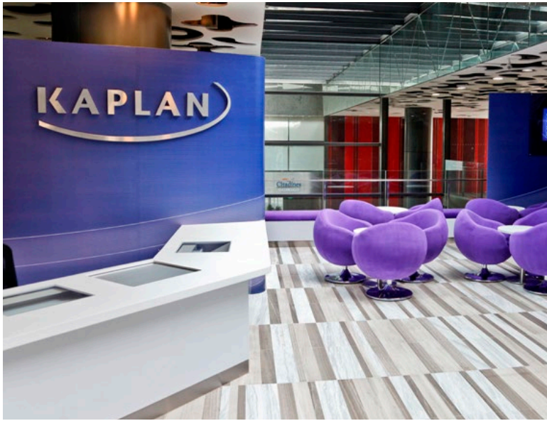
Kaplan City Campus Lounge