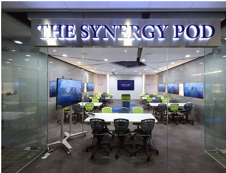
Kaplan City Campus Synergy Pod