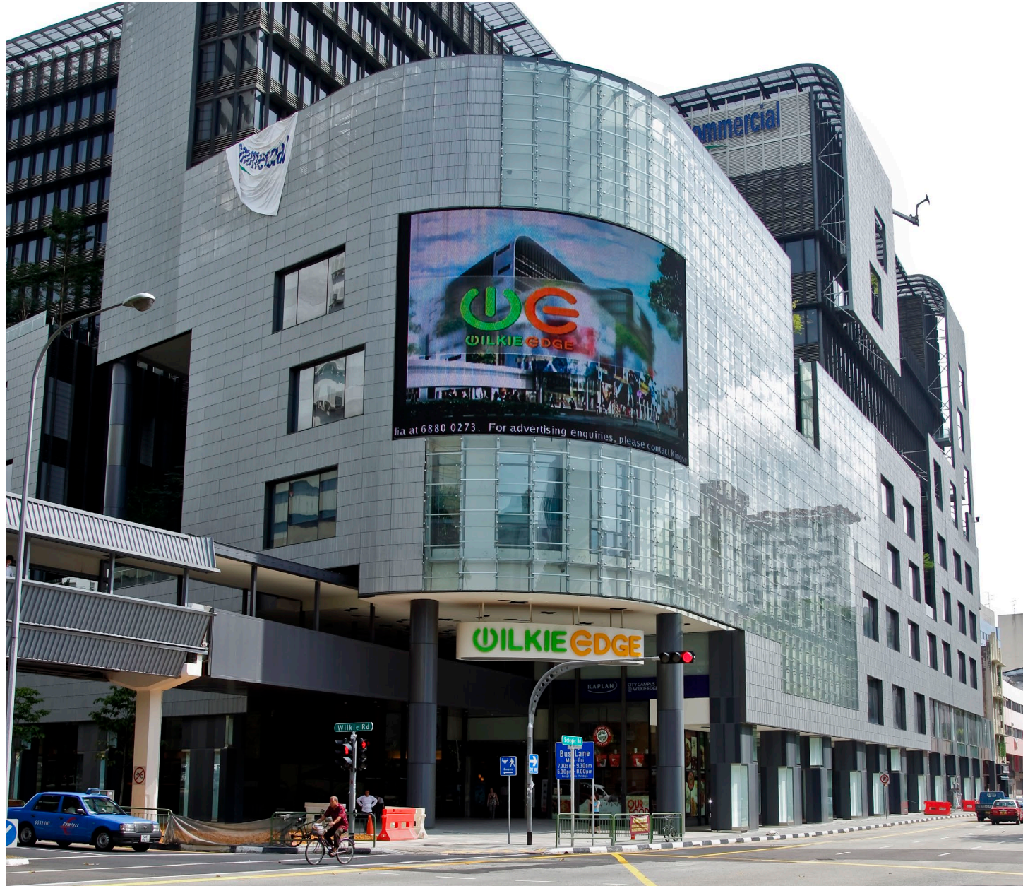
Kaplan City Campus @ Wilkie Edge